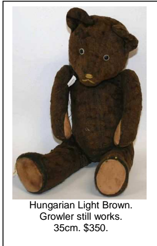
Hungarian Light Brown. Growler still works. 35cm. $350.

The first vocational schools for toy manufacturers were established in Hungary in the 1800's, but bears would not have been made until the early to mid 1900's. Remember Steiff made the first jointed teddy bear in 1904. The rest of the world took a while to catch on... These four bears were likely made in Slovenia (upper Hungary) or in Transylvania, currently belonging to Romania, but formerly part of Hungary. They may also have been made close to Budapest, the capital of Hungary.