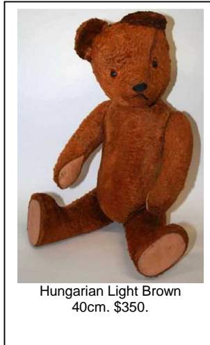
Hungarian Light Brown 40cm. $350.