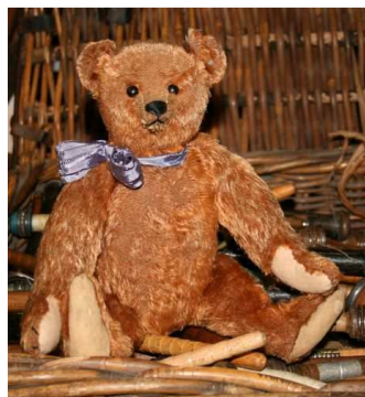
Antique Steiff Bear, cinnamon