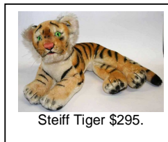
Steiff Tiger $295.