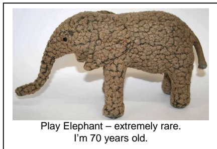
Play Elephant – extremely rare. I'm 70 years old.