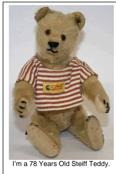
I'm a 78 Years Old Steiff Teddy.

Technically an Antique must be over 100 years of age. That is why the term 'Vintage' is used for items under 100 years. It has been and still is a tradition in Germany to give a newborn baby a Steiff Teddy. This means that vintage Steiff are more obtainable in Germany and Europe as a whole. In Australia, keep your eye out in communities that have a strong German/European ancestry.....or come to Morpeth Bears!