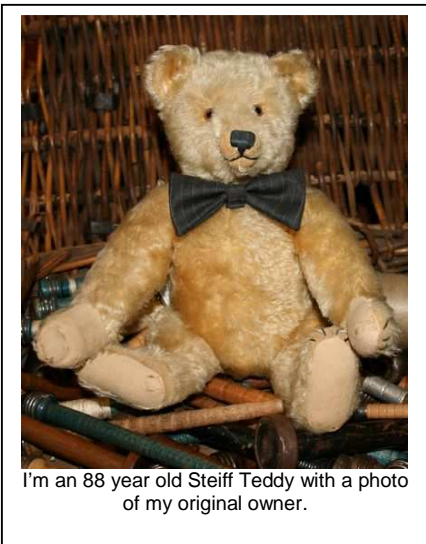
I'm an 88 year old Steiff Teddy with a photo of my original owner.