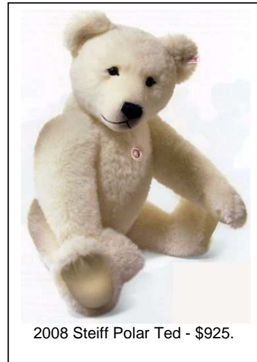
2008 Steiff Polar Ted - $925.

He's big, he's soft and he's the closest you'll get to cuddling a polar bear. Although Polar Ted's airbrushed, realistic and distinctive facial features are modelled on his bearish archetypes from the cold North, his friendly eyes and cute hand sewn nose speak a gentle and loving language. He is a Limited Edition of 1,500 pieces worldwide and has a gold plated button in his ear. Price $925. at Morpeth Bears now.