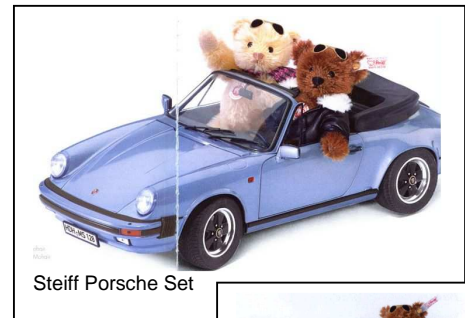
Steiff Porsche Set

In 1983 Porsche set a further milestone in the history of the successful 911 model, with the Porsche 911 Carrera 3.2. For its time it had an unbelievable 231 horsepower. It had the typical characteristics for Porsche: unmistakable lines, elegance and sportiness. The Steiff convertible model is in the scale of 1:12. It is handmade from more than 200 pieces. It has a detailed replica of the motor, engine bonnet and doors that can be opened as well as a steering mechanism that really works. Even after 25 years the Porsche 911 Carrera 3.2 is still a very popular model both in display cabinets - and on the road. The convertible top can be positioned up or down.