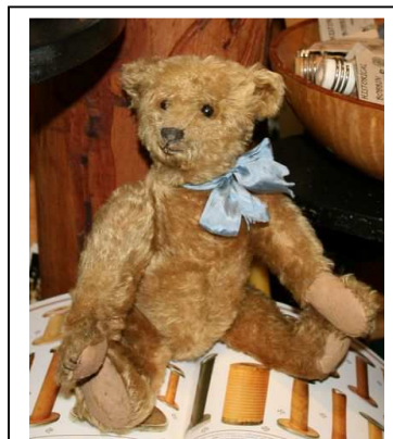
Antique Steiff Bear, blond.

Group of Antique & Vintage Steiff Bears, with one poor soul (front right) I just couldn't resist. He's got the cutest face you ever saw and his hand is bandaged up with sticky tape! He is not a Steiff. I have become quite attached to them all and I know I am going to regret selling them!