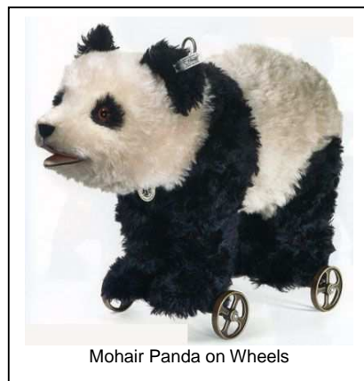
Mohair Panda on Wheels

With the exclusive Porsche jubilee set comes two cuddly Teddy bears who are dressed in the style of the wild 80's. The driver is wearing a very soft black leather jacket trimmed with fur. The passenger has a neck scarf to protect her from the wind. Both are wearing the pilot sun glasses that were typical for the time. Price $850. at Morpeth Bears – Your Specialist Steiff Store.