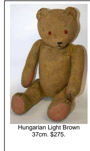
Hungarian Light Brown 37cm. $275.