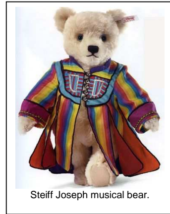
Steiff Joseph musical bear.

Price for Joseph $695. At Morpeth Bears NOW