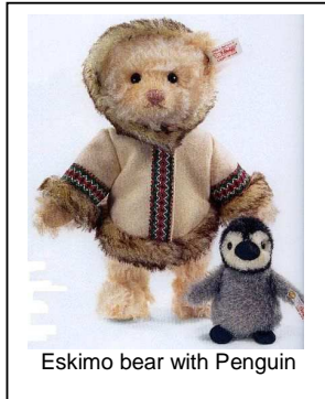
Eskimo bear with Penguin