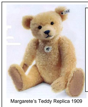
Margarete's Teddy Replica 1909

This beautiful 46cm Steiff bear made of fine light blond mohair, became famous a long time ago. He is a replica of the bear with which Margarete Steiff was photographed along with a dalmation at her feet – a photograph that made company history. It was a special honour for this bear because Margarete was seldom photographed with her bears. He is being reproduced to honour the 100 th anniversary of the death of Margarete on 9 th May 2009. He is woodwool stuffed and has bright friendly wooden eyes. He knows how to make himself heard with his deep growling voice. Limited to 1,909 pieces worldwide. Margarete's Teddy is 'the bear for 2009' but has come early, and is waiting for you at Morpeth Bears NOW. Price $645.