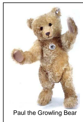
Paul the Growling Bear

Paul is a replica of a Teddy bear from 1908. He is a friendly character and evokes memories of days gone by. He is 46cm tall and made of long-tufted blond mohair that has a little soft shine and the traces left behind by many loving hands. The mohair has been especially treated and discretely patinated with a bronze colour as well as the felt paws that tell stories of the bear's eventful life. He is stuffed with wood shavings. He has a nicer-sounding, longer-lasting growl that was re-developed on the occasion of his 100 th birthday by an organ builder from Giengen which makes him a sought after collectors item with lasting value. Limited Edition 1,908 pieces. Price $650. At Morpeth Bears NOW