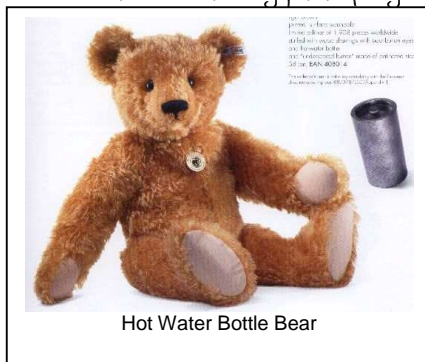
Hot Water Bottle Bear