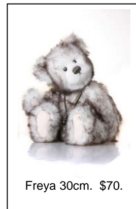
Freya 30cm. $70.