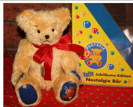
The Bubble Blower $250. Released from Hermann Archives.

Germany 1948 - after the world war. The chemist Dr Rolf Hein experimented with washing powder and discovered a mixture perfect for making bubbles. With the economy on an upswing Dr Hein started the PUSTEFIX factory. With the popular Teddy bear as a logo he created the brand PUSTEFIX for bubbles. The original bubbles were in an aluminium tube, with metal blowing wand and capped with a natural cork. The container created a few problems with leakage and rust, so in 1960 the containers were changed over to plastic materials with the labels printed directly onto the tubes. By 1998 worldwide PUSTEFIX is the undisputed most popular brand for bubbles. A whole new line of bubble toys had joined the standard blue tube. So to celebrate 50 years in business, Hermann green was commissioned to make a Teddy, which is a replica of the Teddy used on the original logo.