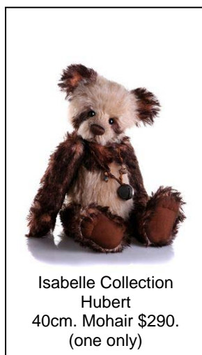
Isabelle Collection Hubert 40cm. Mohair $290. (one only)