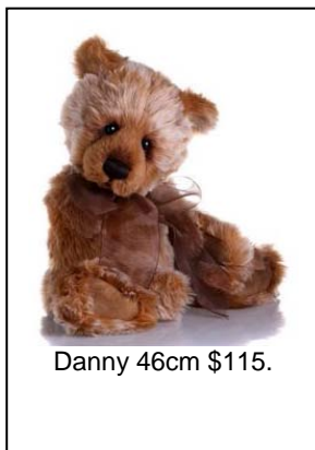
Danny 46cm $115.