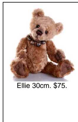
Ellie 30cm. $75.