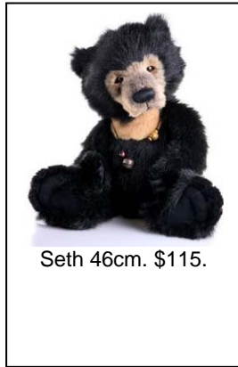
Seth 46cm. $115.