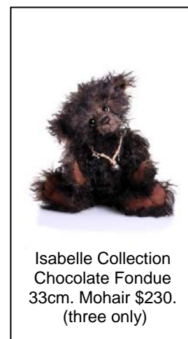
Isabelle Collection Chocolate Fondue 33cm. Mohair $230. (three only)