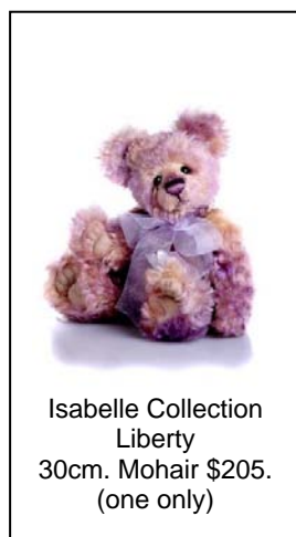
Isabelle Collection Liberty 30cm. Mohair $205. (one only)