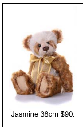
Jasmine 38cm $90.