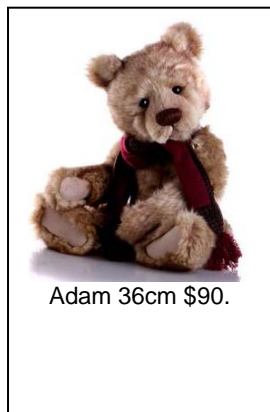
Adam 36cm $90.

Very exciting!! The following Charlie Bears have arrived today. A second shipment is due mid to late December 2009. Where I have quoted quantities under the photos, this means that we will not be getting any more because they have sold out. Where no quantity is quoted, I will be able to order more but cannot guarantee delivery. In other words, if you would like any of these Charlie Bears you will need to be quick. The Isabelle Collection is in very short supply. I have had enquiries from around the world for them, but have decided to give you first choice, so you will have a chance to own one and keep him here in Australia. There are a lot of Charlie Bears yet to arrive during December, January and February. You may put your name on Sue's Wish List if you are after a particular bear.