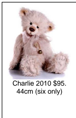
Charlie 2010 $95. 44cm (six only)