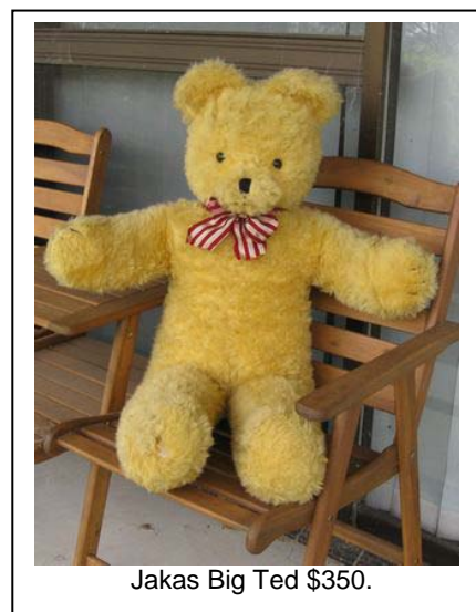
Jakas Big Ted $350.