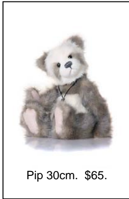
Pip 30cm. $65.