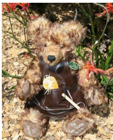
The Old Hermann Bear Stuffer

The bear stuffer is around 38cm in brown tipped mohair, woodwool stuffed. In the pocket of his apron he has a bear's leg, which is almost completed. He has a little stuffing stick and a disk which he is about to put in the leg. Limited to 500 pieces. Price $350. (one only)