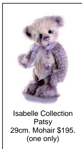
Isabelle Collection Patsy 29cm. Mohair $195. (one only)