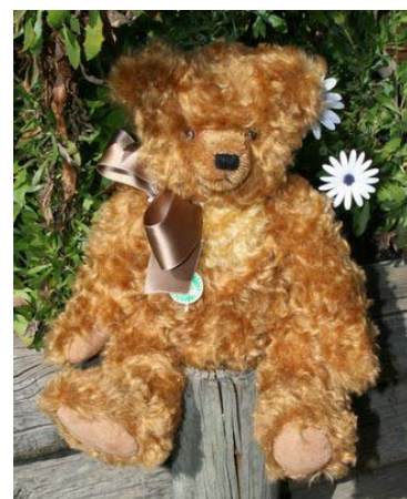
Vintage Style Old Hermann Bear

A 43cm prototype of a bear released in 2009. The edition was Limited to 150 pieces. He is made of original old, brown mottled "never-come-back" mohair from the end of the 1950's. He is woodwool filled and has a growler. He is a golden brown colour with a lighter golden colour section on his chest. He wears a gold/brown ribbon around his neck.