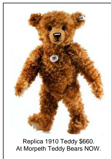
Replica 1910 Teddy $660. At Morpeth Teddy Bears NOW.

The new 45cm replica is made of golden brown curly mohair and comes in a limited edition of 1,910 pieces worldwide. This collector's item has a stately body, black wooden eyes, is woodwool filled and has a clear growling voice. Price: $660.